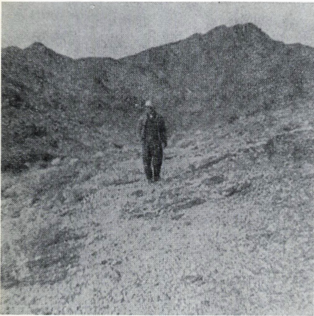
▲George Adamski standing where the Venusian flying saucer (scout ship) had hovered in Desert Center, California on November 20, 1952.